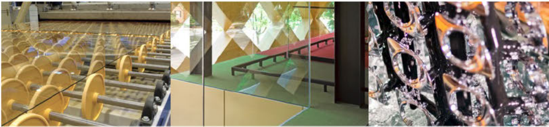
Salesforce Tower, San Francisco built with Guardian Glass, Kingsburg, CA

Guardian Industries is a global company headquartered in Auburn Hills, Michigan. Guardian companies manufacture high-performance float, coated and fabricated glass products for architectural, residential, interior, transportation and technical glass applications; and high-quality chrome-plated and painted plastic components for the automotive and commercial truck industries.